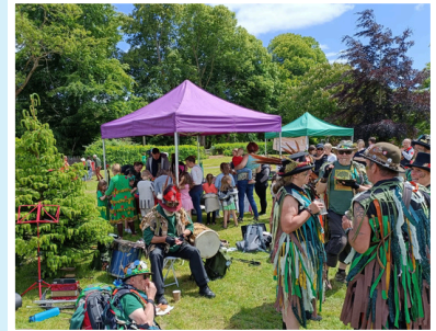
The Big Boniface Bash, June 2024

We have had a great year in 2024 with the D-Day 80th Anniversary commemorations, summer Food Festival and St Boniface Day celebrations. Hundreds of local and not so local people (representatives from our Boniface link towns, Dokkum and Fulda) attended these events making them very special occasions in the town, that will be remembered for a long time.