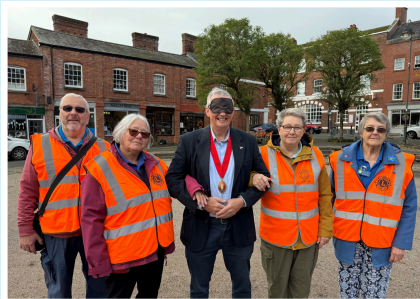
Blindfolded walk with Credition Lions Club.

Credition has real heart in its community, with numerous people volunteering in organisations that provide help and support to local people. As part of World Sight Day, Credition Lions Club blindfolded me and guided me to a local café to buy a coffee, highlighting how visual impairment impacts daily life. The Town Council provide grants to many town organisations, helping them to continue their community work. A big thank you to all of you for being part of our community and to the organisers and volunteers in the town that make it a vibrant place, in which to live, work and enjoy so many events and activities.