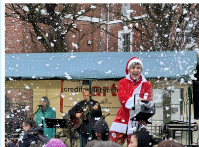
Christmas in Credition 2024.

Our 2024 events ended with a wonderful celebration at the switch-on of the Christmas lights in the town square, which was well attended. Everyone seemed to be enjoying the event as much as ever. Children loved the fake snow (as did some adults), and a happy atmosphere filled the town square.