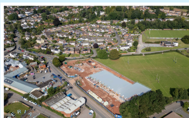
Lidl development.

2025 may well see the start of some changes in our county's local government two-tier structure of district and county councils. The government have recently published their white paper on devolution, trying to improve on local democracy by setting up new unitary authorities across the country. These changes don't usually happen that quickly but the town council will need to be prepared potentially to take on more non-statutory responsibilities and services that are currently being undertaken by our district and county councils.