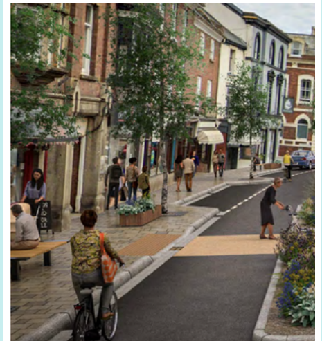
CGI image of what the High Street could look like

Alongside that, we have commented on Mid Devon District Council's CREDITON Town Centre Masterplan and joined district councillors and officers to discuss issues included in the proposals. Of course, the amount and speed of traffic in the High Street affects the air quality, footfall, ambience and usability of the High Street as our principal shopping area. If there were an easy solution it would have been dealt with years ago. Changing the nature of the traffic is a significant challenge to which we still don't have an agreed and achievable answer – we're still looking for one, though.