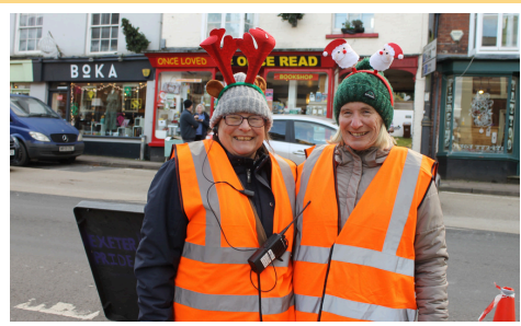
Volunteer marshals on the road closure points

It's ten years since the town council took on responsibility for Christmas lights in the town. For all those ten years, a sub-committee of representatives from local organisations, some key individuals, town councillors and council staff have met several times each year to plan the lighting and the Switch-On event at the end of November when the Christmas tree is lit up in the square along with all the lights throughout the town.