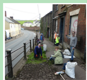
[CUT!] on Exeter Road

Crediton Urban Taskforce [CUT!] was formed following the activity and expertise of a small group of volunteers. [CUT!] is a volunteer-led initiative, supported by Crediton Town Council. The group aims to tackle the maintenance of our pavements, kerbs, paths and other public areas due to service cuts by Devon County Council and Mid Devon District Council. Further information can be found on our website under the Facilities tab.