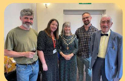
Mayoral Reception 2024

Our public events are all about working in partnership with other groups and organisations in the town. No single agency can achieve everything a town needs so working together is not just better – it's necessary. As Mayor for the last year, I am grateful to all those in Crediton who give freely of their time in so many ways to make our town thrive.