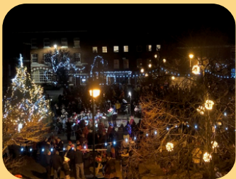
Carols in Square

November's Remembrance Sunday is always a moving occasion, organised jointly with the Royal British Legion. Late November regularly sees the Christmas in Crediton light switch-on – great lights but so much more with the participation of the community in singing, performing and creating the lantern procession around the square (see more on page 5).