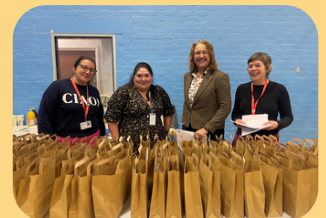
Celebration of Youth