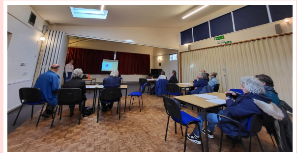
Budget workshops 2023

There are many moving parts on differing timelines all with the same aim of promoting Crediton and making it a better environment for its residents, businesses and organisations.