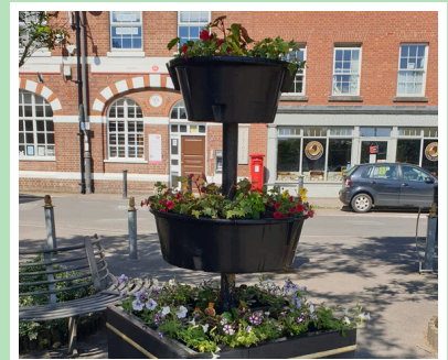
Town Square flower towers

In addition, sponsorship was secured with 4 businesses around the Town Square, in the form of watering the flower towers once/per week. Finally, the Committee made the decision to move away from the usual hanging basket displays and this year focused on perennials and grasses which are pollinator and insect friendly. Not only will these be beneficial for biodiversity, but these plants will only need watering once per week, which will halve the watering costs. Also, with the climate emergency in mind, the total journeys made to Crediton by the contractor will be significantly reduced.