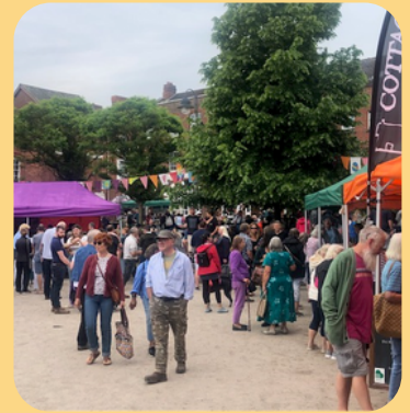
Food Festival 2023

Our year is starting to develop a regular rhythm of community events alongside the 'business as usual' operations run by our small team of staff. The Food Festival reappeared in June 2023 – held for the first time since 2018 (circumstances and Covid interrupted the continuum). It was hard work for the Food Festival committee to get the event going again but the council was pleased to support with funds, road closures, resources and event management. It was a very welcome return for this well-supported event.