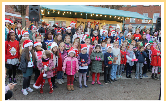
School choirs 2023

In 2023 school choirs, Morris dancers, adult choirs, musicians and performers entertained the crowds for the afternoon before the parade entered the square in the early evening, Father Christmas appeared and the lights went on. There's a predictability about Christmas. We all know what the key ingredients are and it will all happen again this year. We do like surprises though, so you can expect us to ring the changes now and then.