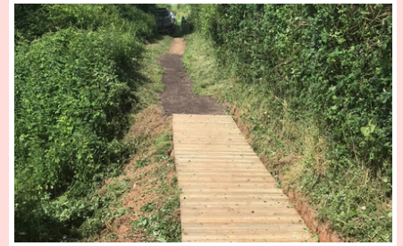
Repair works to Footpath 28

In the Spring of 2024, the annual footpath surveys were carried out, with all 32 footpaths walked and any defects reported. It was agreed to carry out works to Footpath 28 near Salmonhutch, following considerable erosion due to wet weather. This was completed in May.