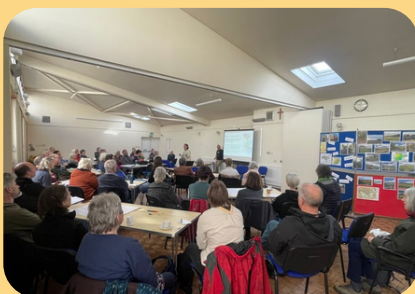
Crediton Community Conversation

In March, we joined with Sustainable Crediton's Climate Action Group to run another Crediton Conversation, this time on Land Use. Around fifty local people discussed the range of uses for land around Crediton – development doesn't just mean housing. We have also commented on the district council's Crediton Masterplan, bringing local knowledge to discussions on the proposals (see more on page 3).